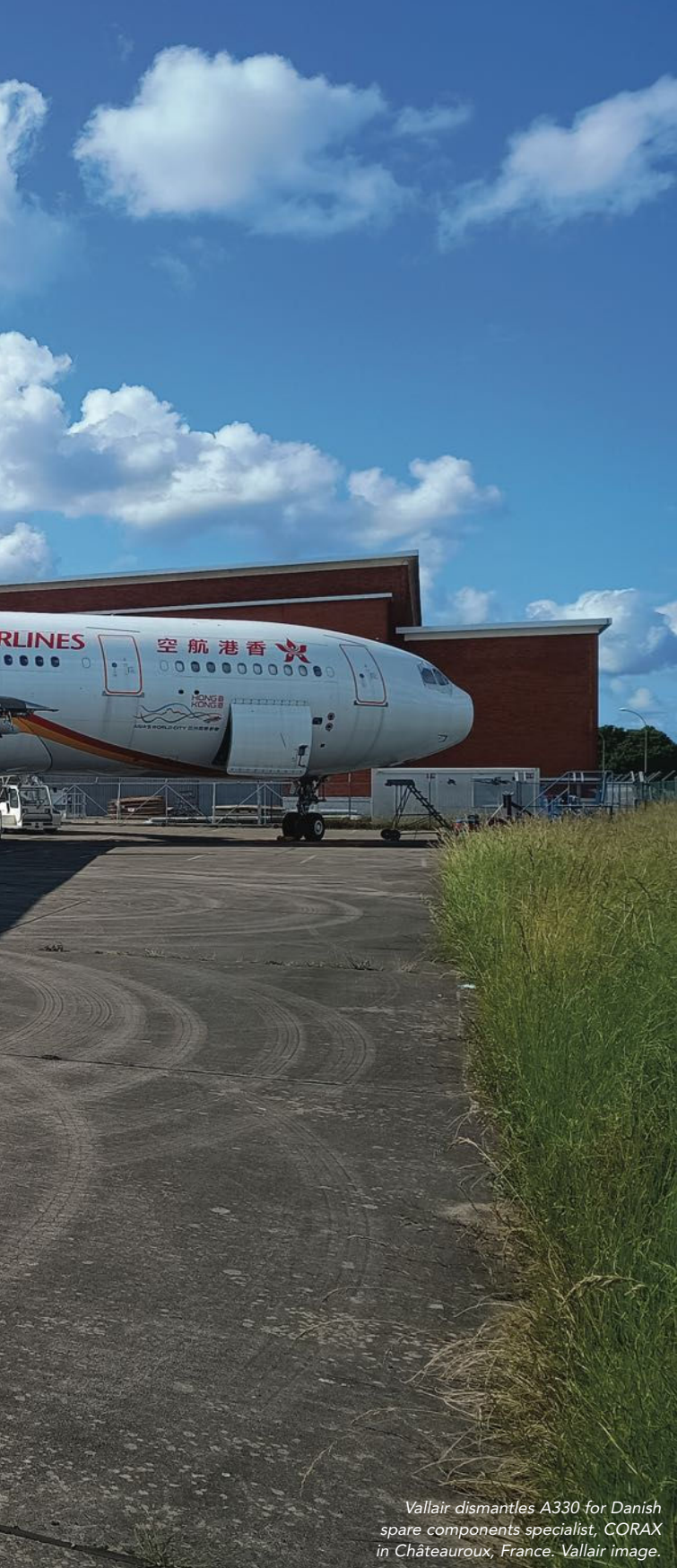
Vallair dismantles A330 for Danish spare components specialist, CORAX in Châteauroux, France.

that brokers and distributors now have a role to play by buying and selling surplus material. However, he cautions that, for safety reasons, the parts need full traceability.