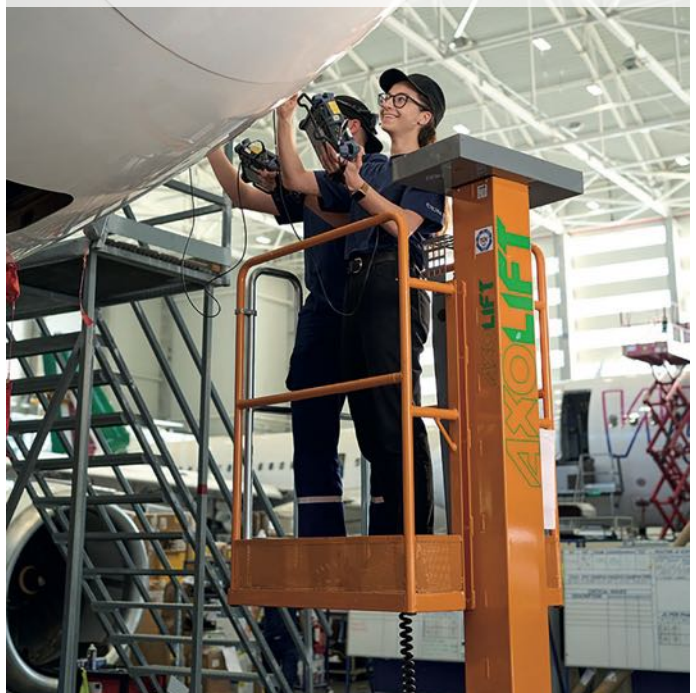
FL Technics can do eddy current testing, ultrasonic testing, magnetic particle testing, penetration testing, thermography testing (water ingress method) and engine and APU borescope inspection (B1 rating) as part of its base maintenance capabilities in several locations.