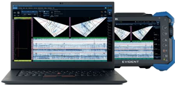
With the ScanPlan software, users can create setups that can then be imported into the device making it easy to prepare. Evident images.

Matheson: I think it's also worth mentioning our dedicated ScanPlan software. It has the same intuitive user interface and tools as the onboard OmniScan X4 scan plan. With ScanPlan software,