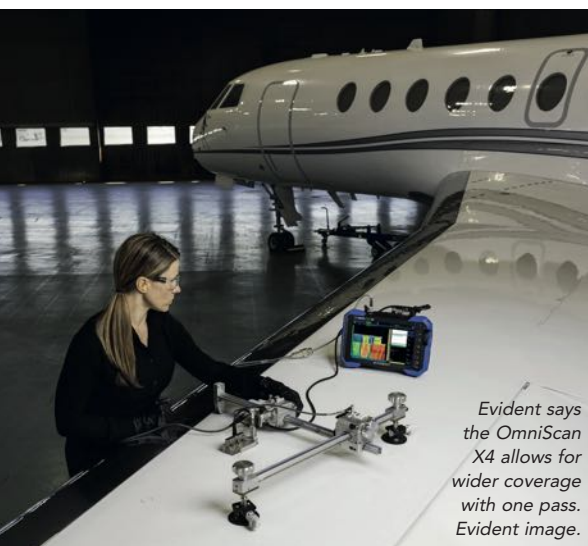
Evident says the OmniScan X4 allows for wider coverage with one pass.

After the technician is finished scanning, they can analyze the data on the instrument or export the info and analyze it with PC software, which we also supply to our customers. It is very easy. The instrument helps and, as we said before, the interface of the instrument is user-friendly. We made sure to design an interface that is very intuitive for everybody.