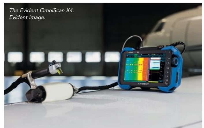
The Evident OmniScan X4.

transition from the OmniScan X3, but also in terms of future advancements. We provide quarterly updates of the instrument's software free of charge to our customers. As the demands of the aviation industry expand and there are more requirements in